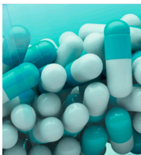
Breaking Research News Page 2