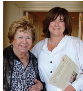
Creating a Legacy Page 7