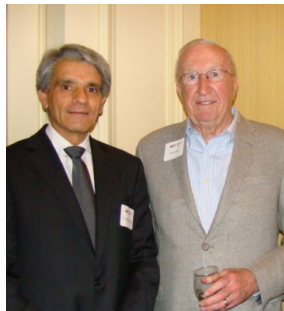
Research Receptions Page 3