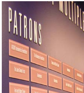
Chapter Donor Wall Pages 4 & 5