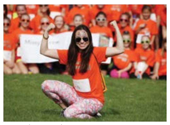
Missy, diagnosed in 2014

When you participate in this exciting community event, you'll raise critical funds to help drive programs and advance cutting-edge research to STOP MS in its tracks. RESTORE lost